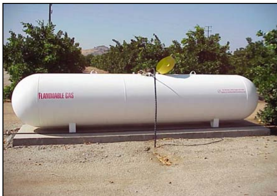
1,000 Gallon Industrial Propane Tank