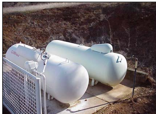
250 Gallon Residential Propane Tanks

Data available from the Consumer Product Safety Commission indicate a total of about 2,400 people were treated in hospitals for propane tank injuries during 2003. Most of the injuries involved burns and strained backs sustained while using five-gallon barbecue grill propane tanks. Propane tanks are addressed under California Code of Regulations (CCR) Title 8, Sections 470 through 494 and California Fire Code (CFC) Article 82.