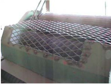
Commercial Potato Seed Cutter

Information available from the Bureau of Labor Statistics indicates approximately 2,700 amputations were associated with agricultural operations between 1992 and 1999. Moreover, 37 of these amputations resulted in fatalities.