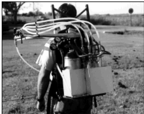
CO 2 Backpack Sprayer

Carbon dioxide (CO 2 ) backpack pesticide sprayers are useful equipment for precisely applying insecticides and herbicides over relatively small areas. Typically, CO 2 backpack pesticide sprayers hold about three gallons of mixed water and chemicals along with the CO 2 cylinder and consequently, a fully loaded sprayer may weigh from 30 to 50 pounds. Safe and effective use of a CO 2 backpack pesticide sprayer is dependent upon accurately applying the proper amount of pesticide. California Code of Regulations Title 8, Section 3203 (7) requires employees to be trained on the equipment they use in the workplace.